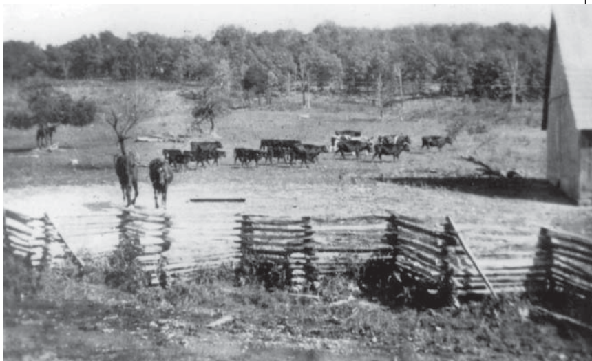
At left, looking east from the Williams Hollow farm house. A road ran between the yard and the split rail fence.