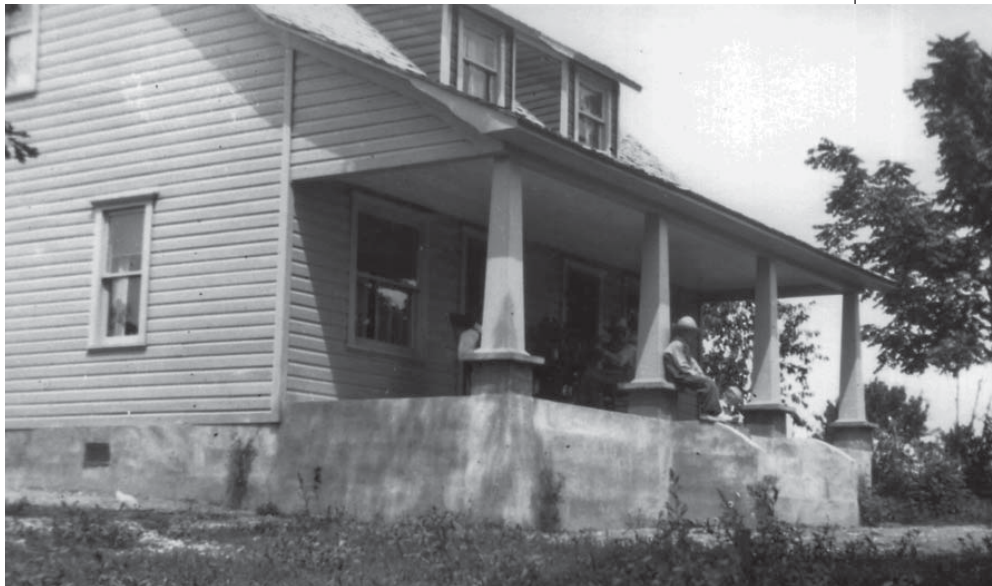
At left, Williams Hollow farm house as originally built with two dormer windows in the upper story. These were rebuilt in the 1940s, and a bay window was built on the south (left side of the house) to replace the single window show above.