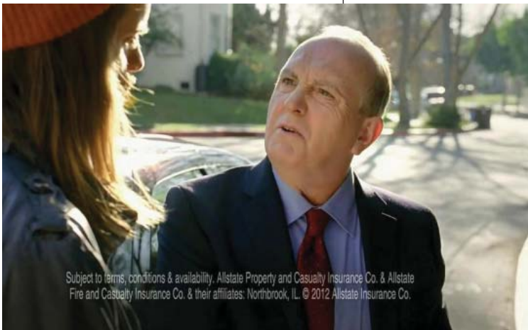
Subject to terms, conditions & availability. Allstate Property and Casualty Insurance Co. & Allstate Fire and Casualty Insurance Co. & their affiliates: Northbrook, IL. © 2012 Allstate Insurance Co.