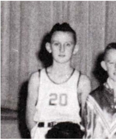
1957-58—me on the Enterprise School 8th grade basketball team.