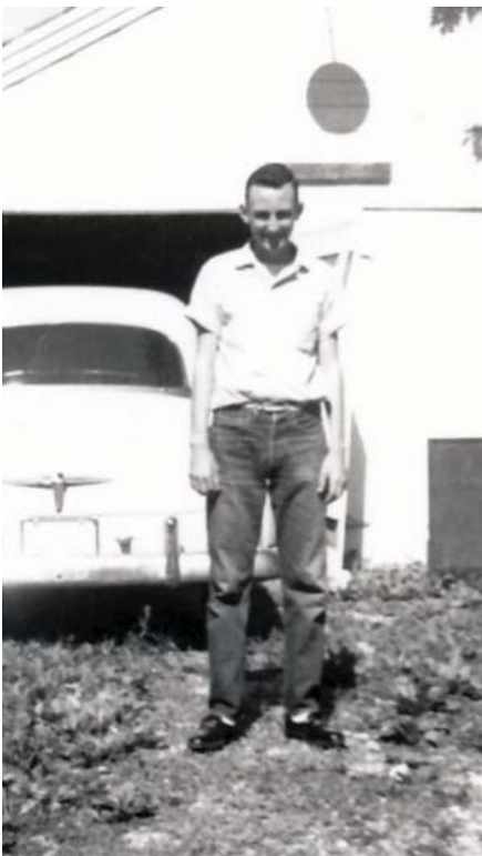
At the house we rented on Seneca St. in Wichita just south of Seneca Square Shopping Center in 1960-62.

1957. My friends and I had the run of the town, and we probably traveled over every street, road and alley, either on foot or on our bicycles. A lot of what I observed was good, but I heard about and observed a lot of bad. I heard and witnessed lots of biases, and I saw how people could treat each other badly. At that time in the 1950s, Catholics were considered to be as bad as Communists, and (by city ordinance) no black person could spend the night in the town. Once when the carnival came to town, a rumor spread that it included a black man, and all us boys ran down there to see him.