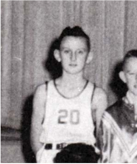
1957-58—me on the Enterprise School 8th grade basketball team.