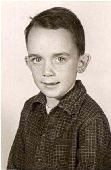
SCHOOL DAYS 57-58

“Life growing up with eight siblings and all the cousins and aunts and uncles and Grandma was a lot of fun. We had lots of great memories.”